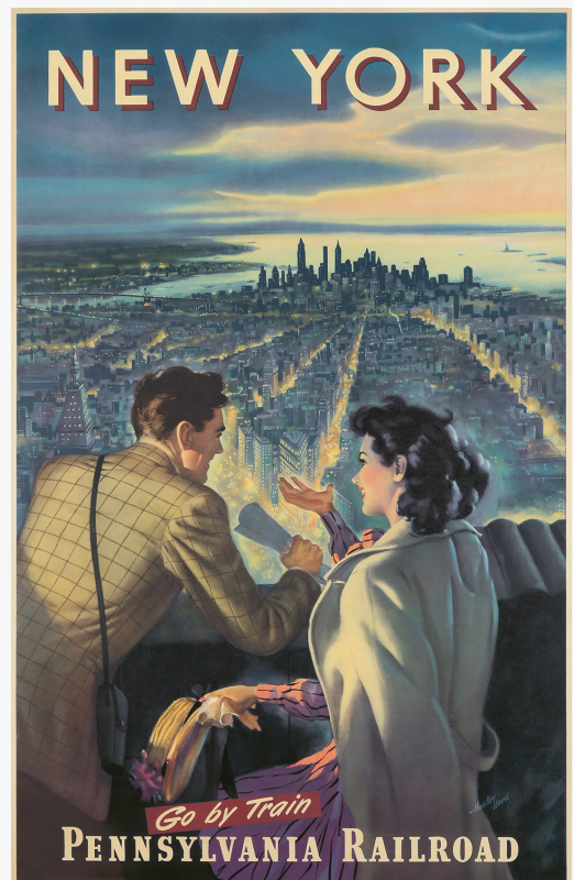
Harley Wood's breath-taking vista for New York / Pennsylvania Railroad, 25 1/4 by 40 3/8 inches (est. $8,000-$10,000).