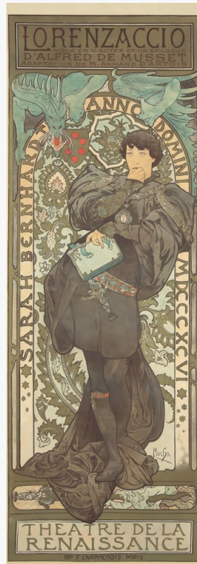
Alphonse Mucha's (1860-1939) decadent promotion of Sarah Bernhardt in Lorenzaccio (1896), 28 by 82 3 / 4 inches (est. $10,000-$12,000).