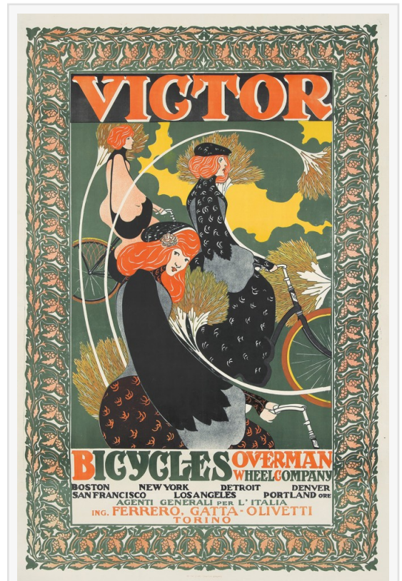
William H. Bradley's (1868-1962) revered and rhythmic design for Victor Bicycles / Overman Wheel Co. (1896), 39 ¼ by 60 ¾ inches (est. $20,000-$25,000).

Public viewings will be held daily from October 11-26. For more information, visit