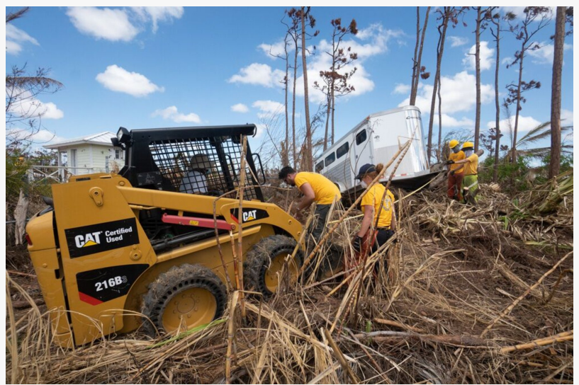
The Volunteer Minister took on getting the horse trailer down from where it had lodged in the trees during the storm.

Watch films based on the tools of the Volunteer Minister on the Scientology Network .