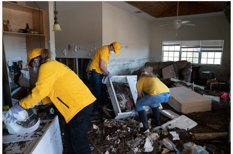
The work can seem endless midway through the cleanup.