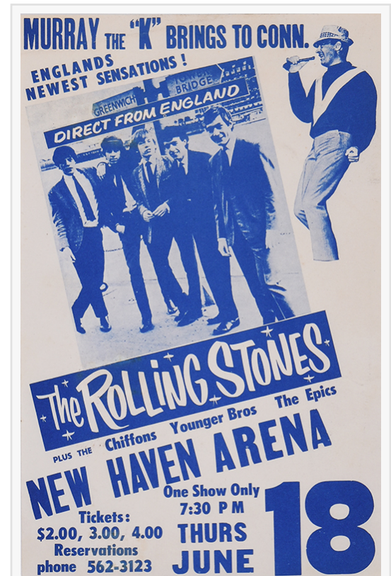
Rolling Stones Handbill New Haven Arena June 18, 1964 Up For Auction Now