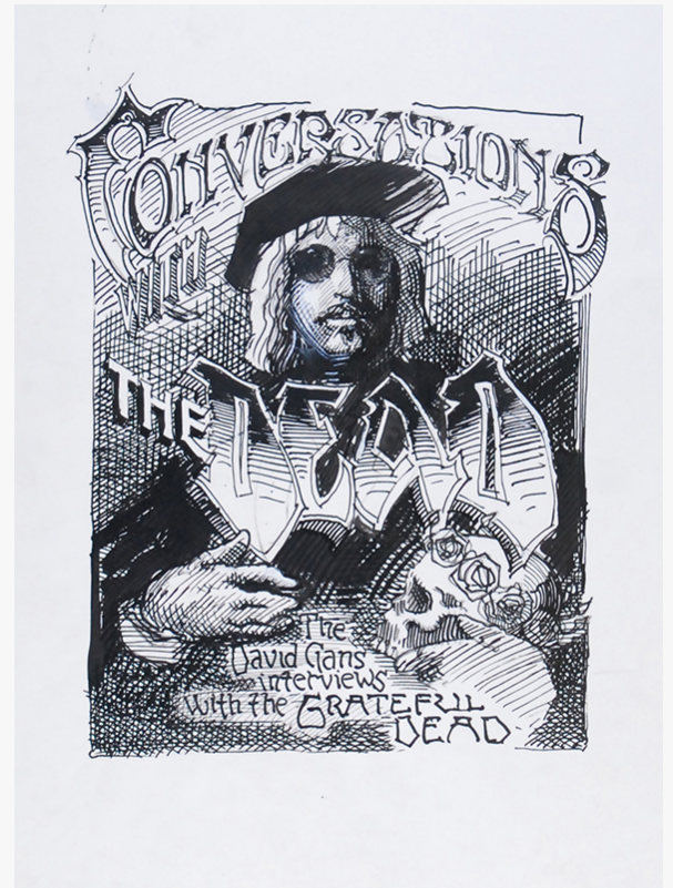
This Original Rick Griffin Artwork Is Up For Auction Now