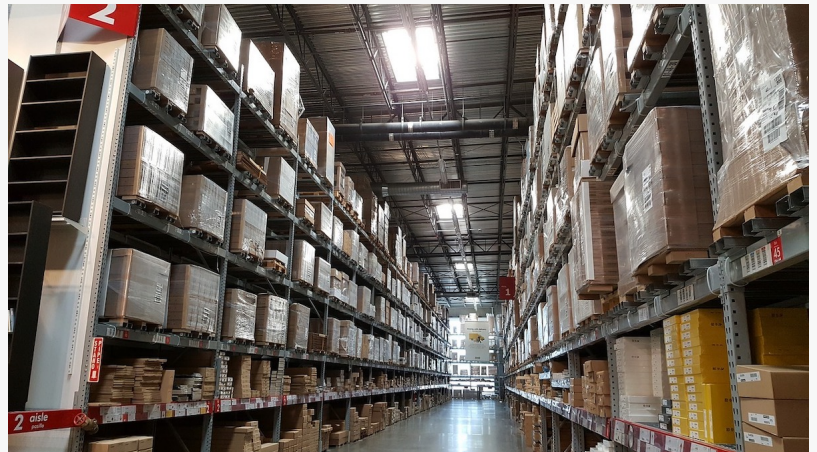
CBD Wholesale Indiana