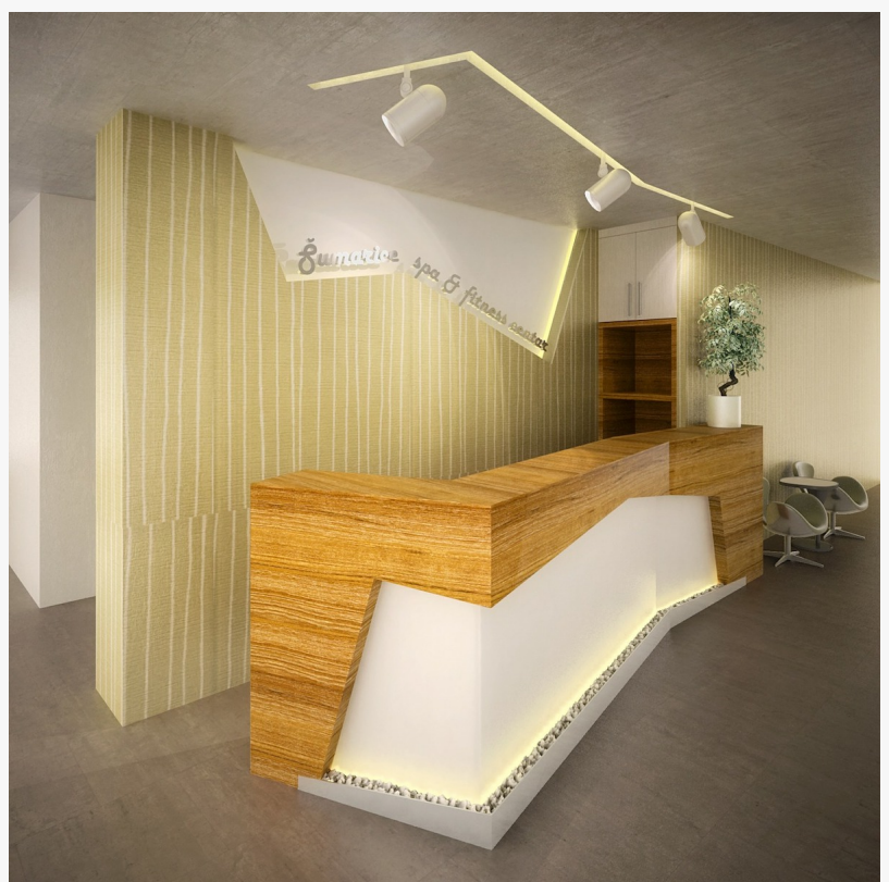
Buy CBD Oil Wholesale in Indiana

Energy Drinks: Our CBD energy drink packs come in a delicious berry flavor and help to boost your strength and provide the energy you need for physical or mental activity throughout the day. Wonderful as either a pre-workout boost or a post-workout recovery, an energy boost is as easy as mixing our specialty blend with water and eTXoying.