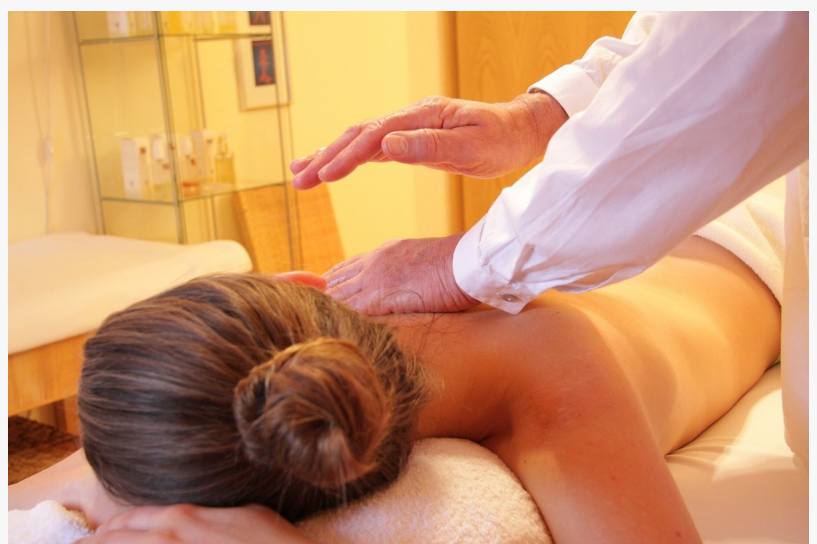
Buy CBD Wholesale in Indiana

Although the Farm Bill Act of 2018 calls for THC levels to not exceed .3%, for CBD products to be legal, Palm Organix intentionally removes all levels of THC from their entire product line. Additionally, Palm Organix™ pure premium CBD oil products have an industry high ratio of CBD to Hemp Extract versus our competitors in the CBD marketplace resulting in the finest CBD products available to consumers.