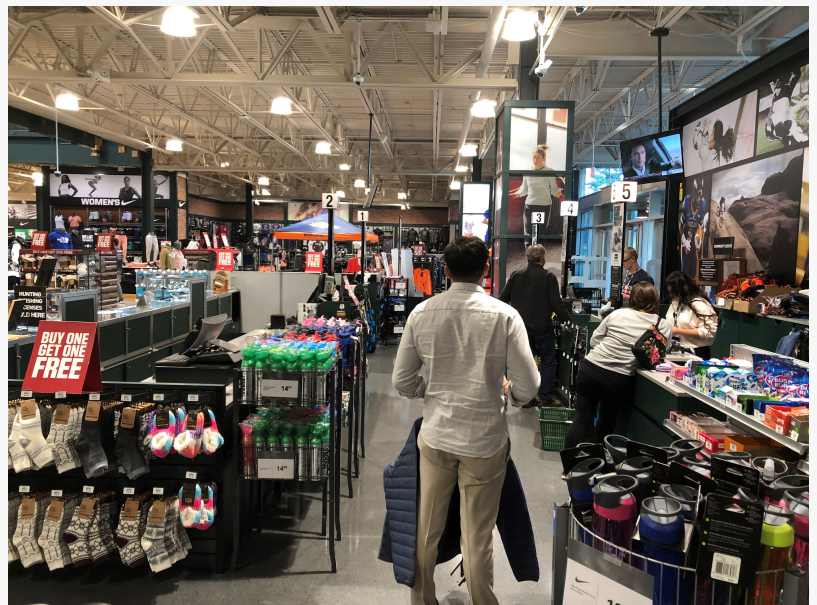
Dick's Sporting Goods gives their customers a BOOST.

This press release can be viewed online at: http://www.einpresswire.com