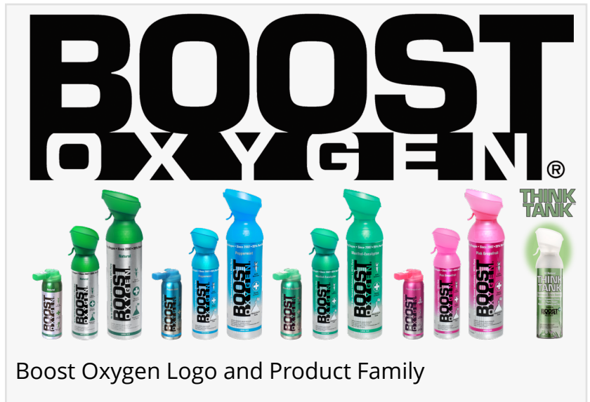
Boost Oxygen Logo and Product Family