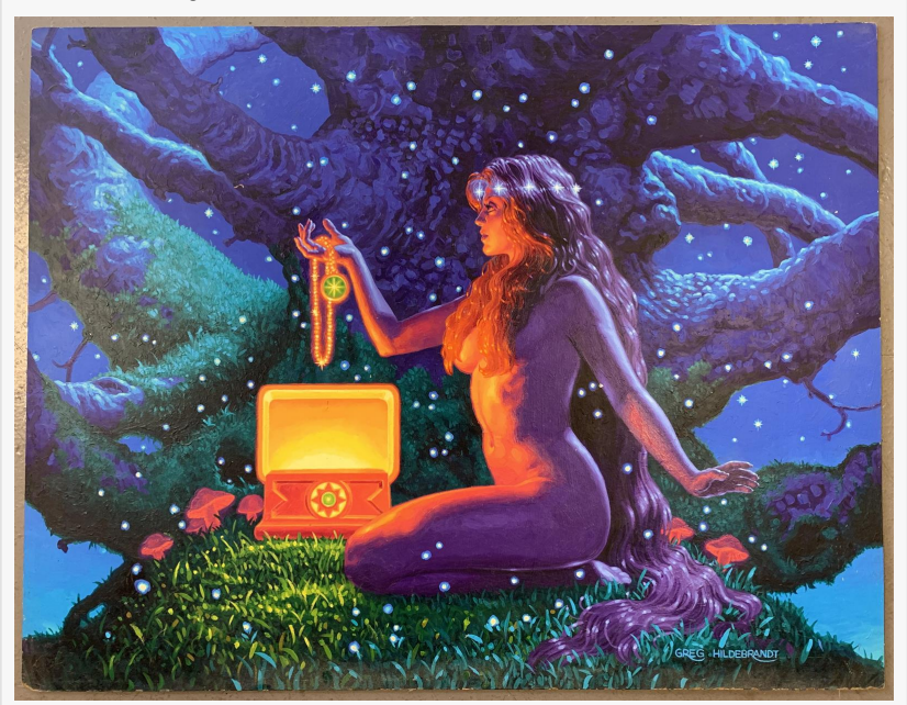
Huge oil on Masonite original trading card illustration art from 1992 by Greg Hildebrandt (American, b. 1939), whose twin brother Tim is also a SciFi and fantasy artist.