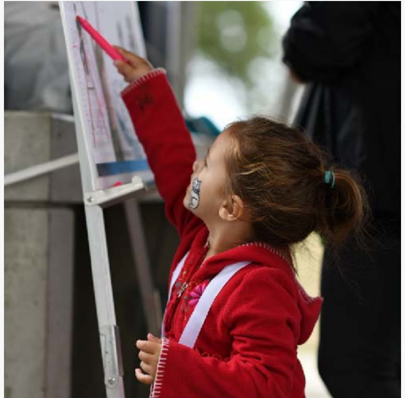
Young supporter signs the drug-free pledge.