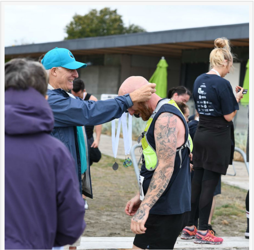
Everyone is welcome to run and support the drug education initiative

Media Relations Church of Scientology International +1 323-960-3500 email us here Visit us on social media: Facebook Twitter