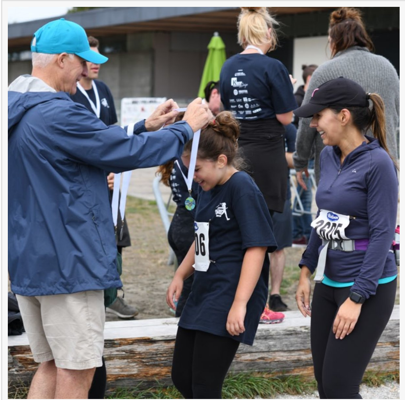
Everyone wins at the annual Drug-Free Dash in Tsawwassen, British Columbia.

For more on the society or to get information about the drug education materials, email