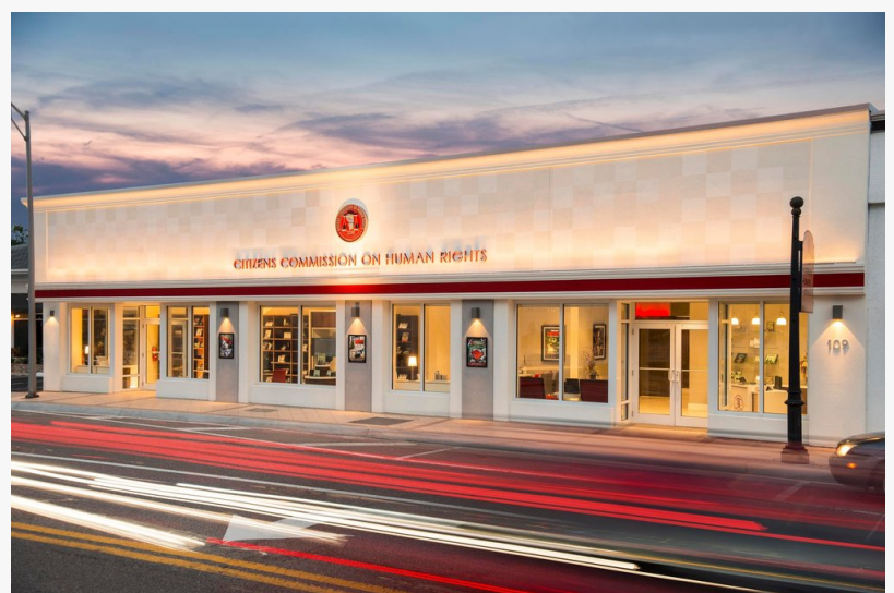
The headquarters for CCHR Florida are located in downtown Clearwater.

About CCHR: Initially established by the Church of Scientology and renowned psychiatrist Dr.