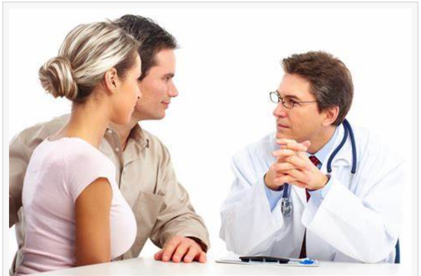
Share KNOWHEN Fertility App results with your doctor

The freedom to test multiple times, and countless days in a row, gives women a clear picture of their cycle's progression. The cost-effective reusable KNOWHEN® requires no test strips and no messy urine samples. FDA cleared and CE Certified with US clinical studies to validate its efficacy, KNOWHEN is a reliable way for premenopausal women to also avoid unexpected pregnancies.