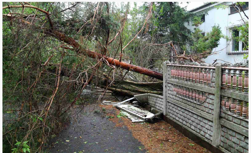
Charlotte Storm Damage