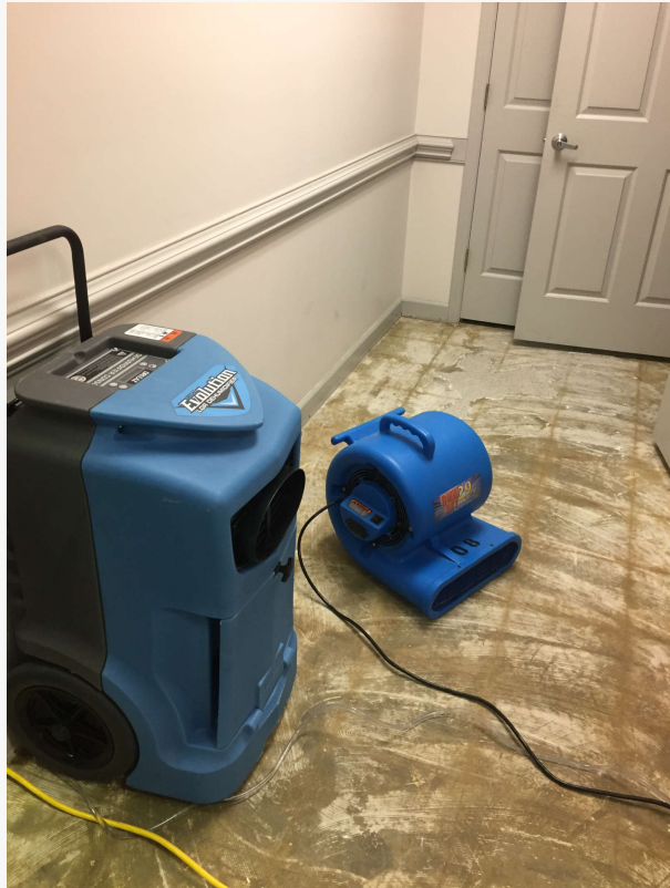
water mitigation equipment in Charlotte

If flood damage has already occurred, the certified mitigators from 24/7 Water Damage Charlotte are ready to be dispatched to locations in Cornelius, Concord, Matthews, Rock Hill,