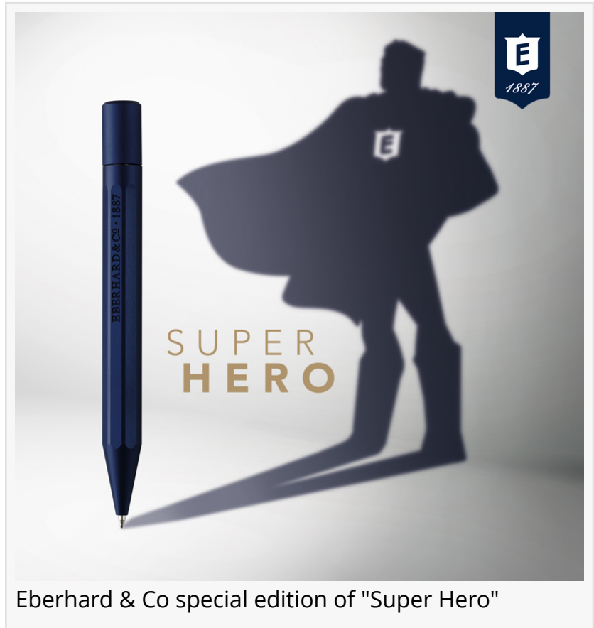
Eberhard & Co special edition of "Super Hero"