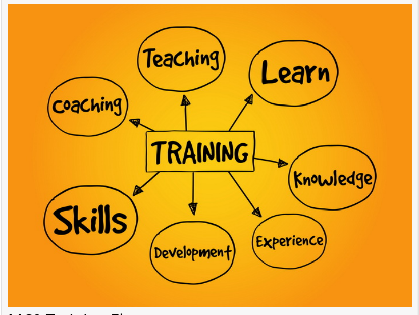
MC2 Training Elements