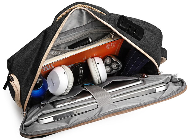
Full of useful compartments and pockets

With ergonomics and high-quality materials as the backbone of each product, Uber Backpacks has become an industry leader and an ever-growing force in the market. This has led the company to push into new territory and develop exclusive designs and smart backpacks like