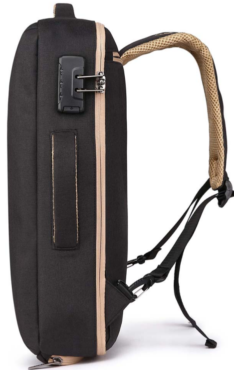
Ultra-comfortable straps for long days