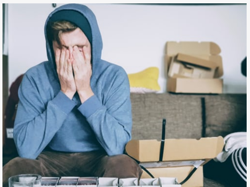
Stressed Out At Work

The Workers Union The Workers Union 02477981194 email us here Visit us on social media: Facebook Twitter