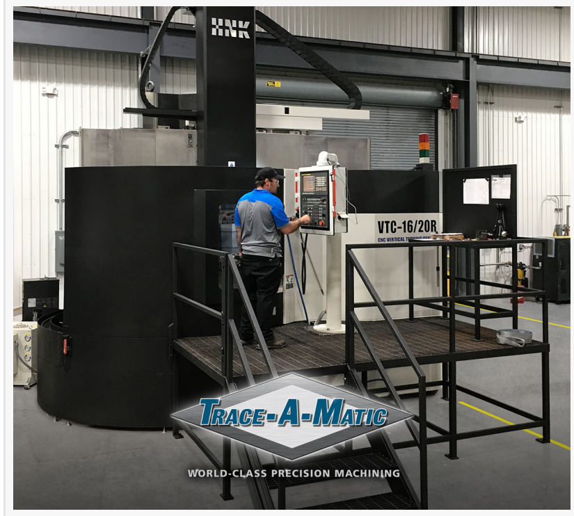
New HNK VTC 16/20R CNC Vertical Turning Center

"The HNK VTC brings opportunity as we expand our machining envelope to a turning diameter of 79" and 65"