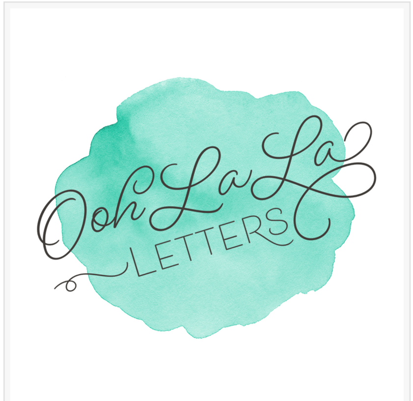
OohLaLaLetters Invites You to Capture the Moon Dust

Several products come in violet, aqua, and rose hues to capitalize on today's trends.