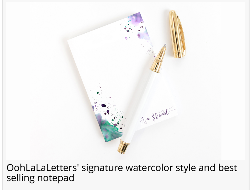
OohLaLaLetters' signature watercolor style and best selling notepad