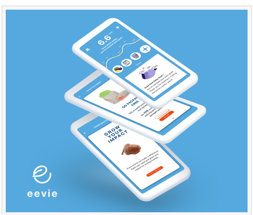
eevie is the eco habit tracker that helps you improve your carbon impact without compromising convenience

LONDON, UNITED KINGDOM, October 15, 2019 /EINPresswire.com/ -- eevie, the eco habit tracker helping you improve your carbon impact without compromising convenience, today announced the release of its mobile app on iOS and Android, revolutionising the field of DIY sustainability. With the planet in crisis and time running out, eevie gives the power back to the people to take action against climate change with the help of their smartphones, one small eco-friendly change at a time. The first eco-habit tracker to understand its users' individual behaviour, eevie was carefully designed to suit their lifestyle and preferences instead of giving generic solutions, making it easier than ever to recycle, reuse bags, cups and