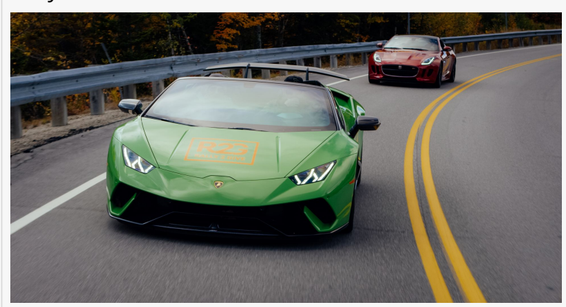
Rally 2 Give Cars