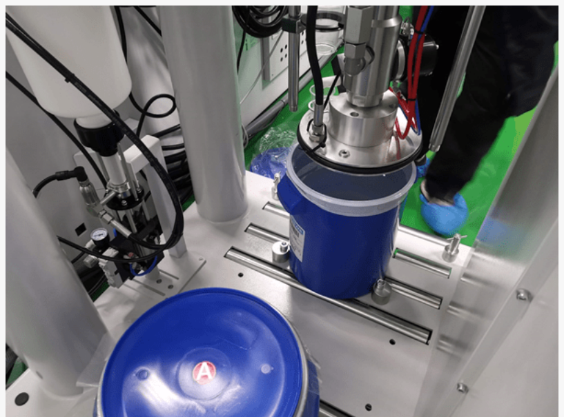
Manufacturing the LSR Part