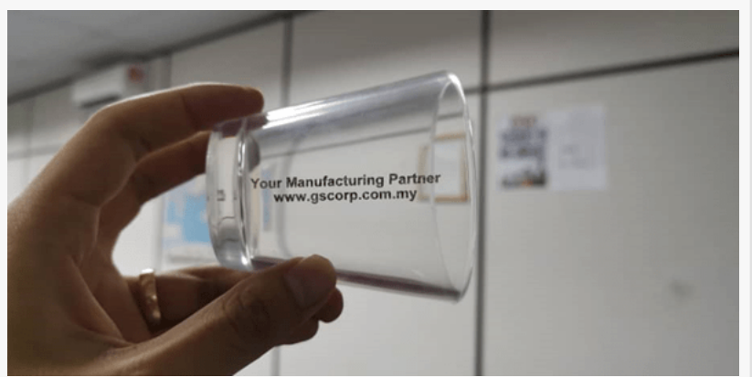
LSR Demo Product from Ge-Shen

The result of this will be showcased at K 2019. To see is to believe, so Ge-Shen decided to produce one of the most universal forms, a form which clearly demonstrates its manufacturing capabilities, a form which customers will be happy to use and which will convince them during each and every use of the form of the quality of Ge-Shen's LSR moulding – a DRINKING GLASS. This will be given to visitors to the booth as a sample.