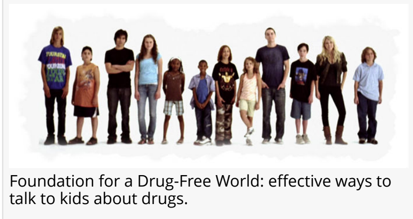
Foundation for a Drug-Free World: effective ways to talk to kids about drugs.