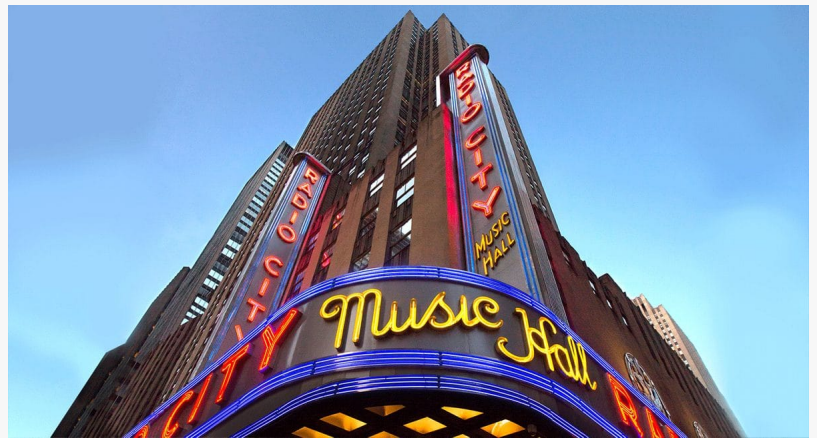
Radio City Music Hall Entrance