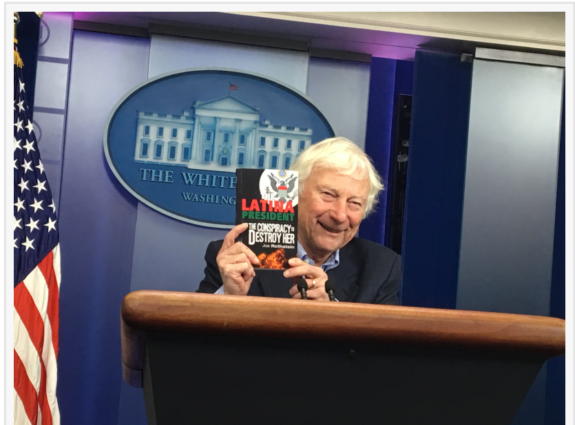
Is It Real, Or Is It Fantasy

Joe Rothstein Gold Standard Publications +1 202-257-8285 email us here