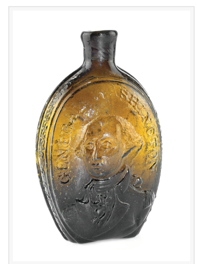
Washington-Taylor: Washington/Taylor 'Firecracker' flake amber bottle, one of only three known in this color (est. $35,000-$45,000).

This press release can be viewed online at: http://www.einpresswire.com