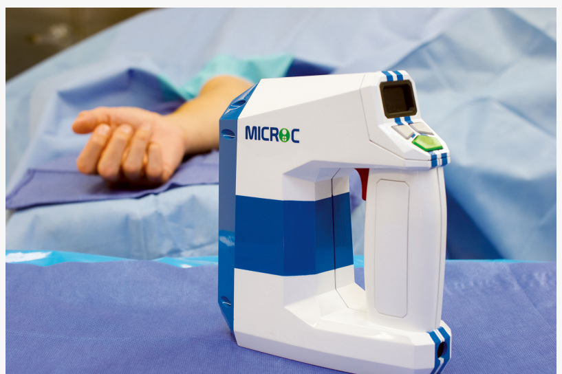
Micro C is compact, handheld X-ray device offered by OXOS Medical

Murem Sharpe OXOS Medical +1 912-247-4255 email us here