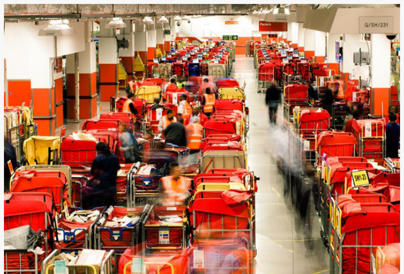
Royal Mail Sorting Room

The Workers Union stands in solidarity with postal workers. As a fellow campaigning organisation that exists to serve the interests of its members,