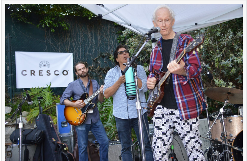
Robby Krieger at WEEDCon West cannabis expo