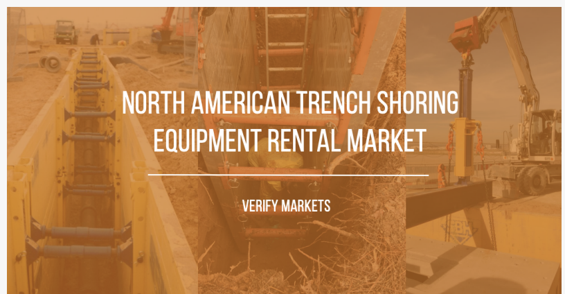
Trench Shoring Equipment Rental Market North America

SAN ANTONIO, TX, UNITED STATES, October 22, 2019 /EINPresswire.com/ -- A new analysis by Verify Markets shows the North American Trench Shoring Equipment Rental Market was valued at over $1.6 billion in 2018. The market is expected to reach revenues over $2.8 billion in 2025. The key drivers in this market include growth in the construction industry, investments in infrastructure projects, and natural gas infrastructure upgrades. Some of the key challenges in this market are high startup costs and availability of logistics support staff. Shoring equipment is becoming increasingly popular due to the inability to have open cut excavations. A key equipment trend is miniaturization due to rising fuel costs. The largest motivator for renting trench shoring