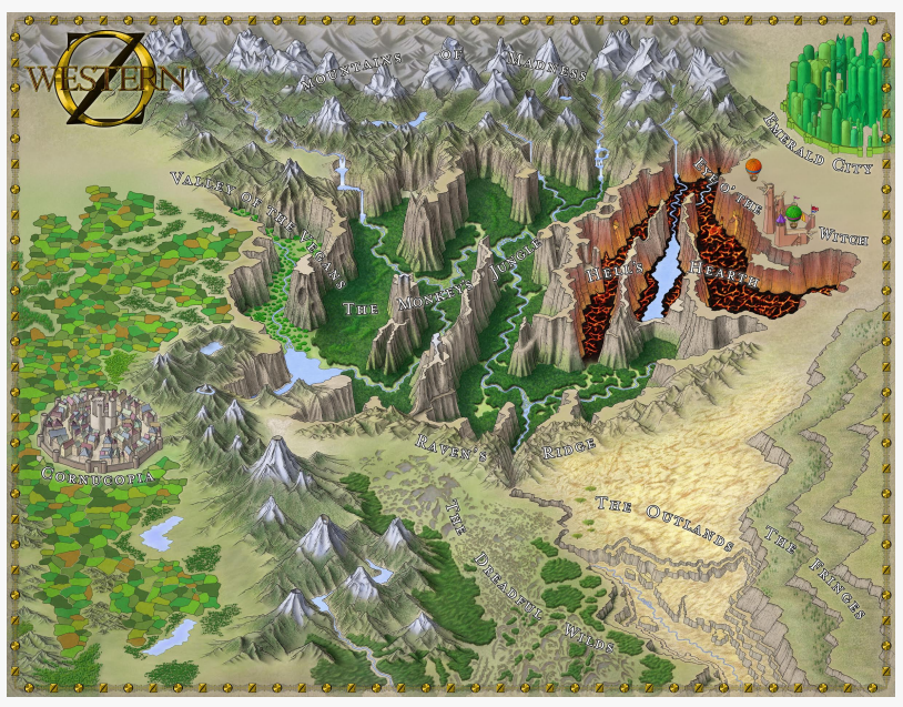
Original Art - Wizard Was Odd Trilogy, Book Two: Trail of Tears, (Wizard of Oz from Toto's Perspective)

This press release can be viewed online at: http://www.einpresswire.com