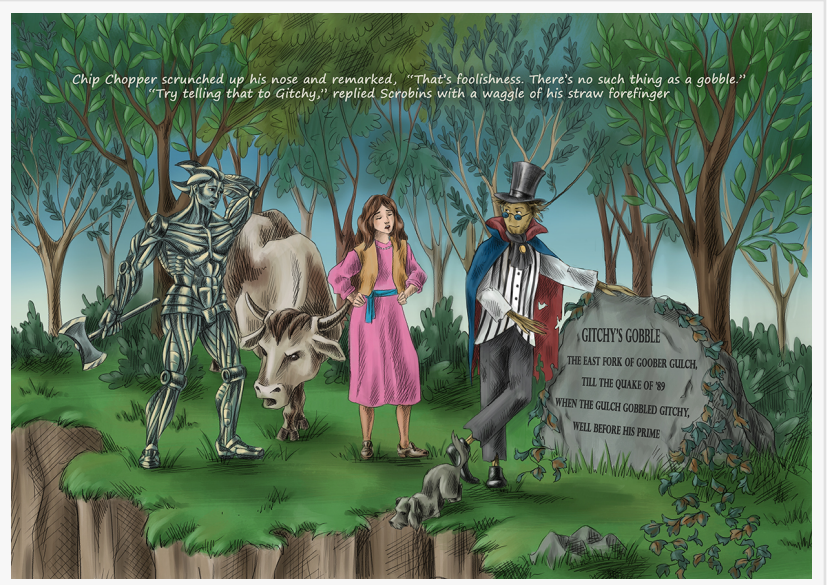
Original Art - Wizard Was Odd Trilogy (Wizard of Oz from Toto's Perspective)

created for Toto's tail and Trail of Tears.