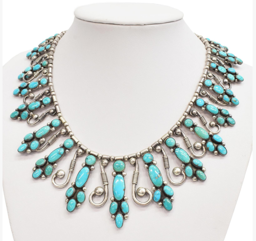
Modernist sterling silver necklace by Frank Patania, Sr., having graduated alternating scrolls and drops with serrated bezel-set turquoise stones and a hook closure (est. $4,000-$6,000).