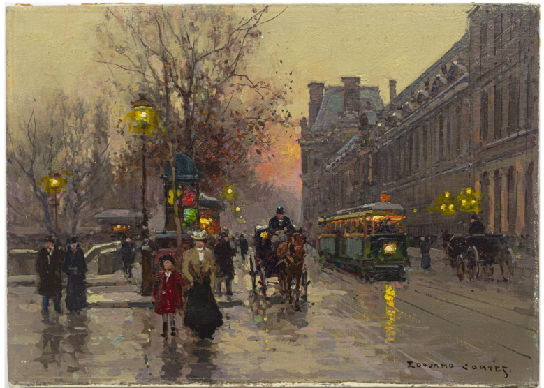
Framed oil on canvas by Edouard Cortes (French, 1882-1969), titled Louvre Seine Quai , signed lower right and verified as authentic, measuring 13 inches by 18 inches (est. $12,000-$18,000).