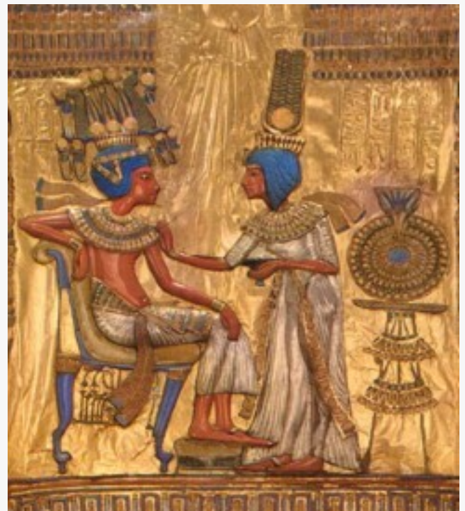
Enlargment of Back of Tut's Chair