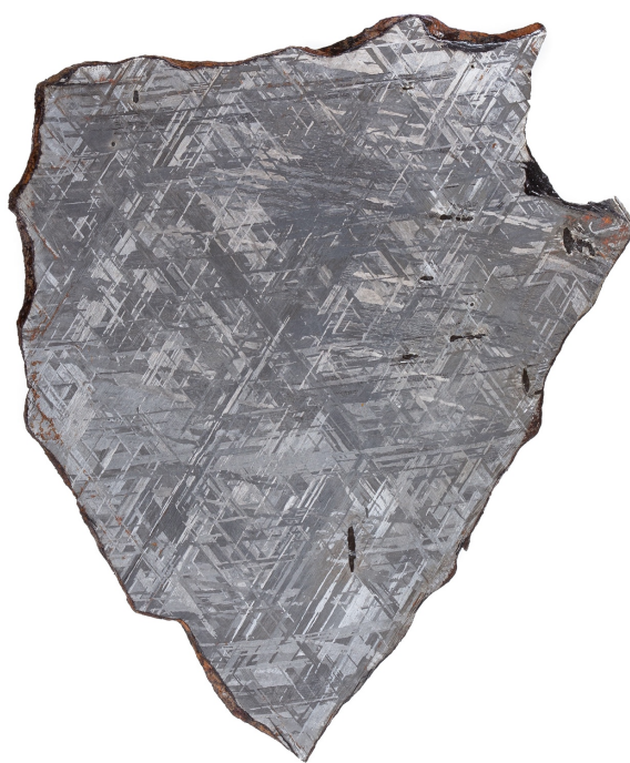
Gibeon meteorite full slice, stone chondrite, H5, Namibia, 542g (est. $1,500-$2,000)

This press release can be viewed online at: http://www.einpresswire.com