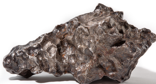
Sikhote-Alin meteorite, iron IIB, Coarsest Octahedrite, Russia, complete individual, 10600g (est. $20,000-$30,000)