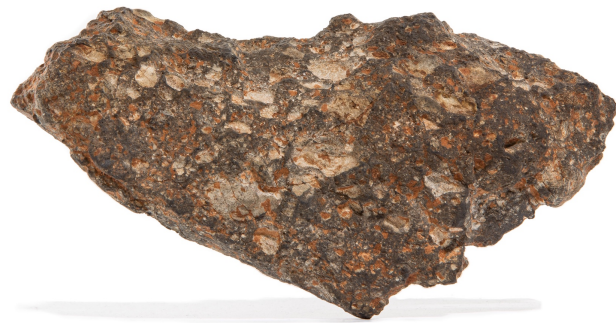
NWA 11273 lunar meteorite, Feldspathic individual fragment, 419g (est. $60,000-$80,000)