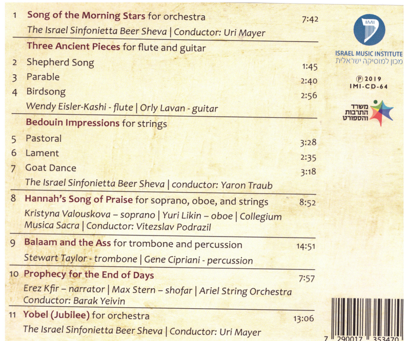
Back Cover of Max Stern: Retrospective listing orchestral, chamber and vocal compositions

This press release can be viewed online at: http://www.einpresswire.com