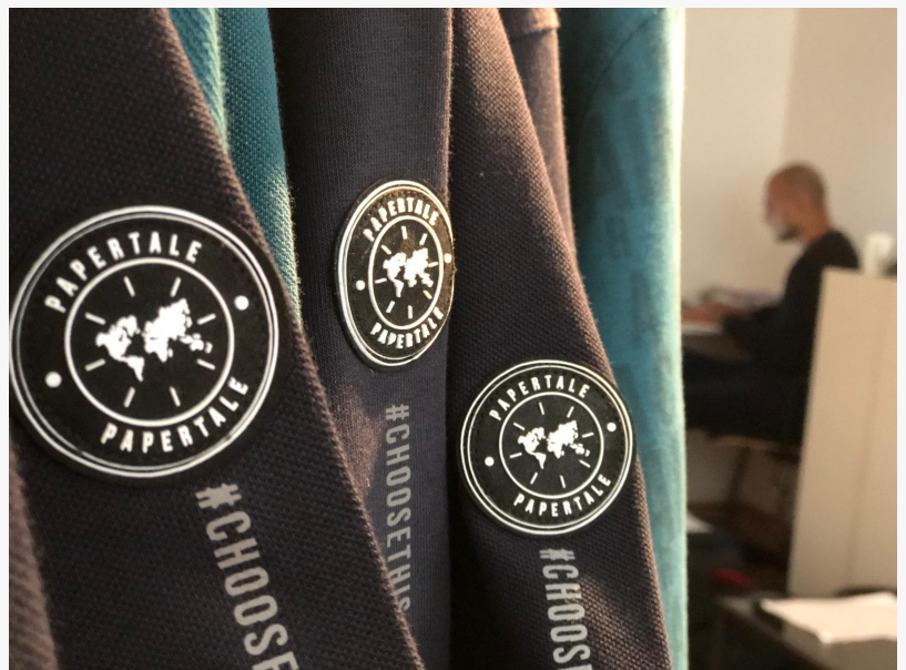
As a proof of concept, PaperTale technology has been implemented in the fashion industry and has made a concept collection consisting of three garments for men and three for women