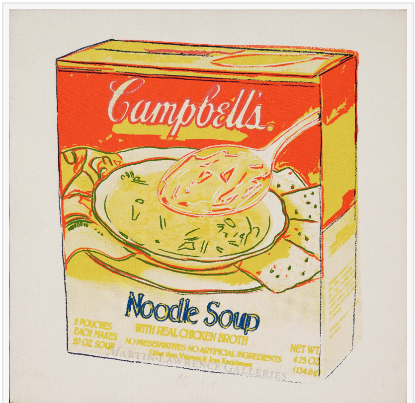
Andy Warhol, Campbell's Soup Box: Noodle Soup, acrylic and silkscreen on canvas, 1986