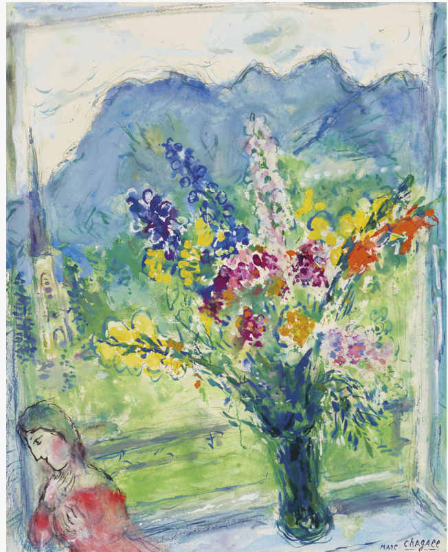
Marc Chagall, Fleurs Devant le Clocher, 1967, gouache, watercolor, colored wax crayons and pencil on paper laid down on canvas