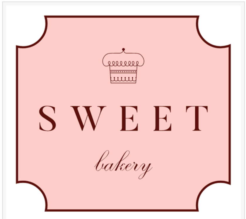
Sweet Cupcakes Boston

For more information, please contact us using the information below: Contact: