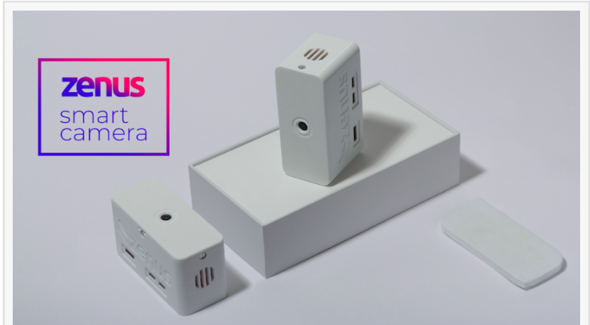
Zenus analytics camera

To learn more connect with Zenus via email at info@zenus-biometrics.com