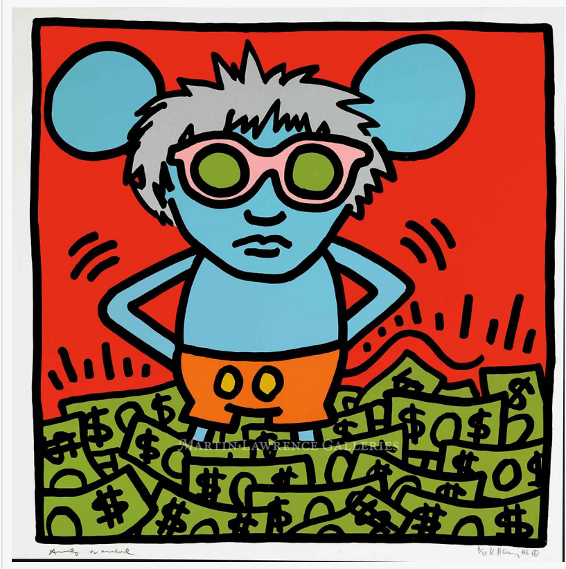
Keith Haring, Andy Mouse, 1986 (#1), hand-signed silkscreen