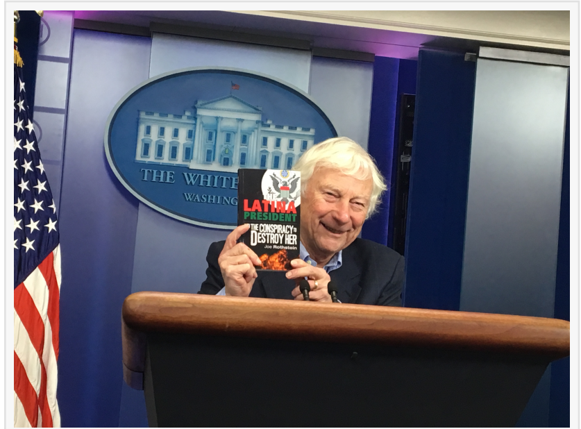
Is It Real, Or Is It Fantasy

Joe Rothstein Gold Standard Publishing email us here +1 202-257-8285 Visit us on social media: Facebook Twitter