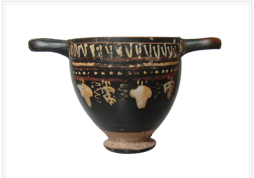
Handsome Greek Gnathian skyphos (Apulia, 4th century BC) having a body decorated in a vine motif and featuring a low pedestal foot and two horizontal loop handles (est. $300-$400).

In addition to live and Internet bidding, phone and absentee bids will be accepted. When bidding this way, a 19.5 percent buyer's premium will apply, versus a 24.5 percent when bidding online via LiveAuctioneers.com or Invaluable.com , and 20 percent via the Ancient Resource Auctions bidding platform and app. Previews are by appointment only; to schedule one call 818-425-9633.