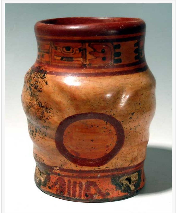
Mayan polychrome jar from the Uluá Valley of Honduras (circa 400-800 AD), 6 ¼ inches tall decorated with deeply carved step pyramids and glyphic symbols (est. $800-$1,200).

Gabriel Vandervort Ancient Resource Auctions +1 818-425-9633 email us here