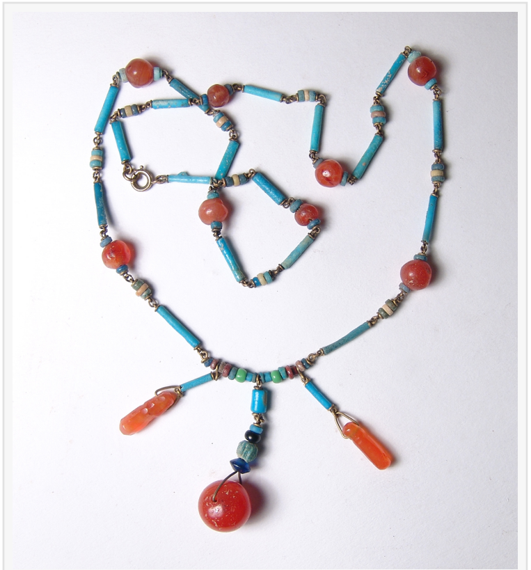
Beautiful Egyptian beaded necklace with carnelian stone embellishments from the Late Period (circa 664-30 BC), 22 inches long, from the collection of musician Ruth Deyo (est. $400-$500).