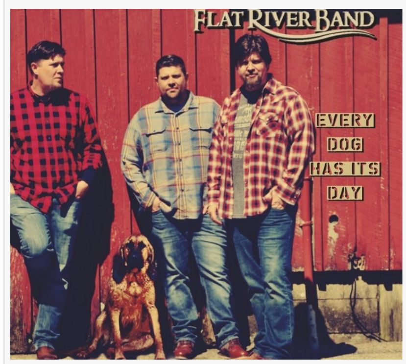
Flat River Band "Every Dog Has Its Day"

This press release can be viewed online at: http://www.einpresswire.com