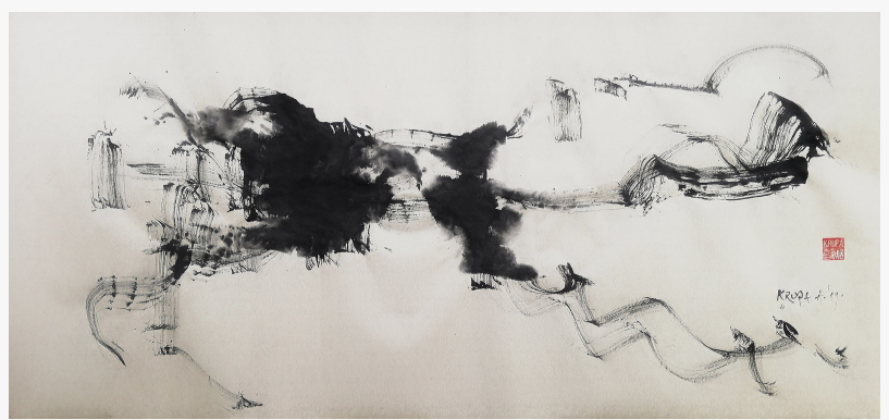
The Western New Ink Art movement work by Alfred Freddy Krupa. One of 53 inks on display on this thematic one-man show.

This exhibition selection contains a wide range of works from those of a small, intimate format over the traditional elongated rolls of thin mulberry/rice paper to a large "gallery" size ink on raw canvas. The motifs include landscapes, veduta, works inspired by Japanese wood-carvers, the current personal and social situation, nudes/figures and animals... His genuine unique interpretation of the various amalgamated art forms and styles create a link between the established genre(s) and many new questions that concern contemporary art in general and in particular the New Ink Art movement. Often at the level of deep and symbolic significance.