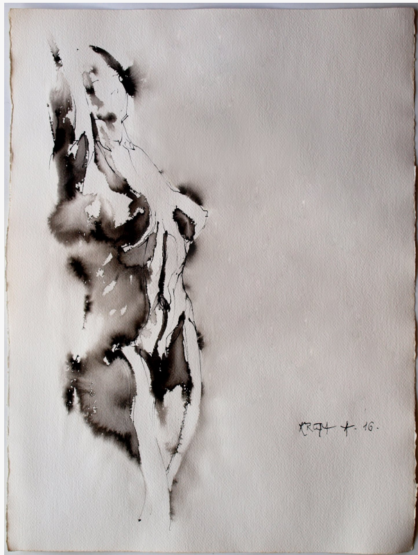
One of the best know Western New Ink movements works by Alfred Freddy Krupa. On display in this thematic one-man show.

Krupa's inks can be found in significant museum collections such as the TATE Britain Library in London, the Modern Gallery (MG) in Zagreb, the Croatian Academy of Science and Arts (HAZU)-