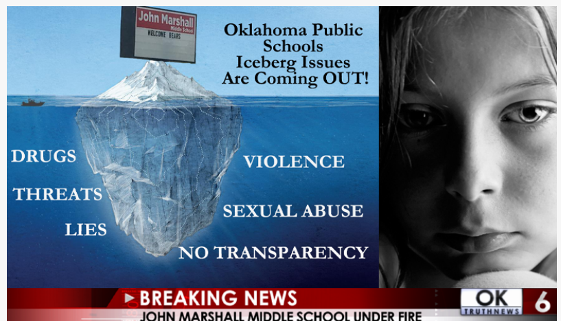
Oklahoma Public Schools Iceberg Issues