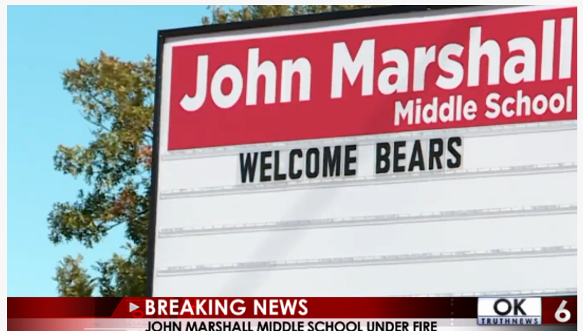
John Marshall Middle School - Oklahoma City, OK