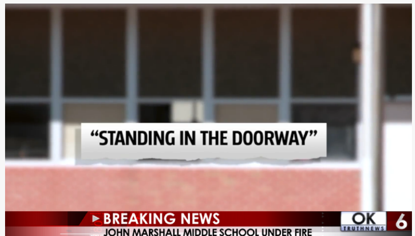
The Truth Will Come Out