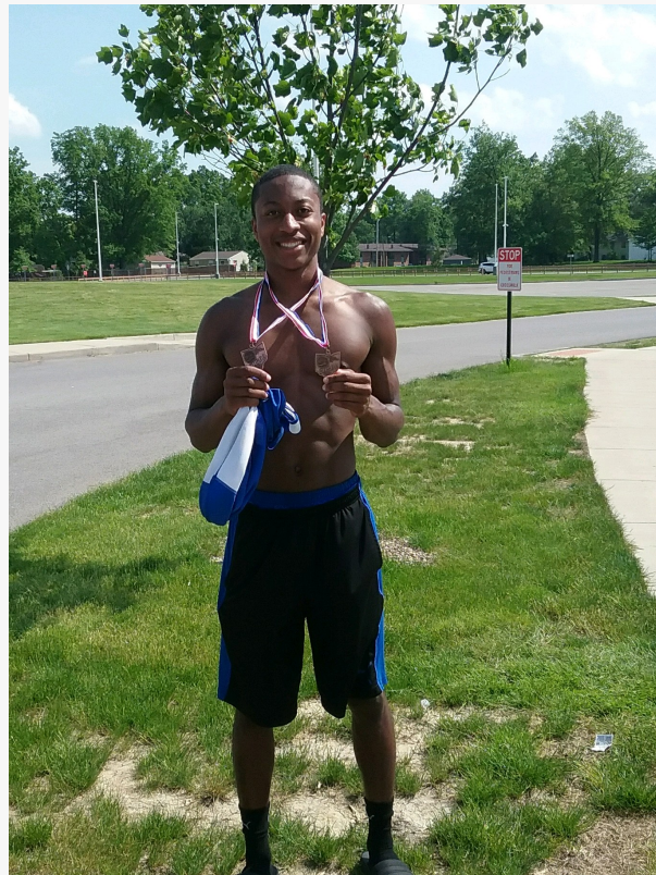
Track State Qualifier