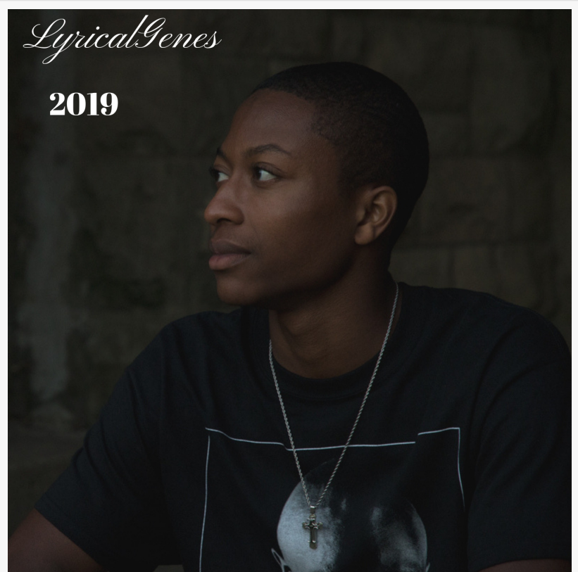
LyricalGenes Critically Acclaimed Album Cover