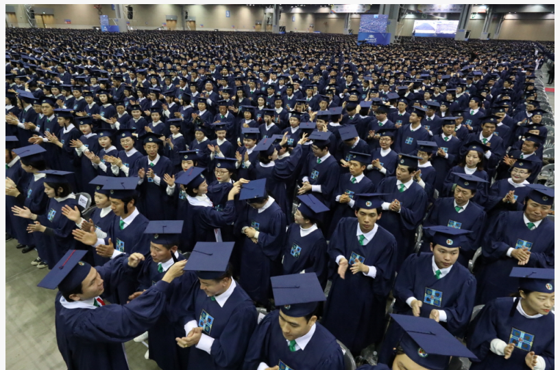
Moving of the Tassel at 100,000 Shincheonji Graduation