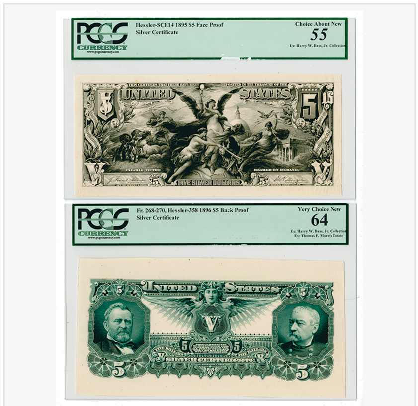
U.S. Educational $5 1895 & 1896 Series Silver Certificate Essay Face Progress Proof Rarities