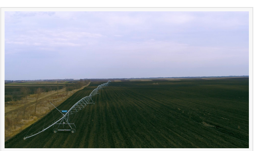
AGRICULTURE LAND WITH IRRIGATION SYSTEM; The farm consists of agriculture land of approximately 1.400 ha, of which 434 ha are owned, 952 ha are rented on most fertile ground in region

As the World Organization for Animal Health warns, the disease has triggered a global crisis and a quarter of the pig population is dying of African