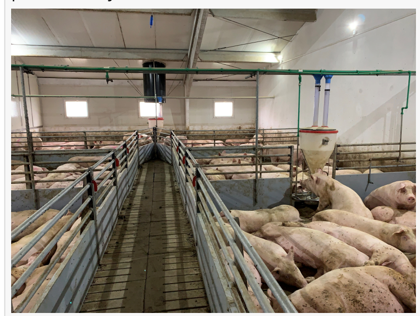
TOTTALY PROTECTED PIG FARM FROM ASF; Total capacity of 700 sows and 20.000 growers. It is one of the highest-quality farms in this part of Europe. It has the status of "nucleus" farm.