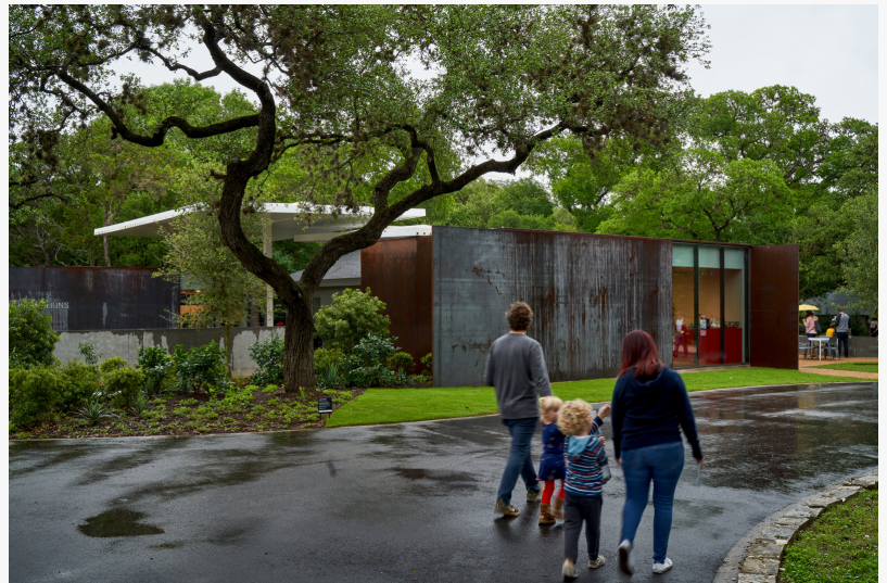
Moody Pavilions- Laguna Gloria

Conservation Foundation Headquarters New Orleans, Louisiana