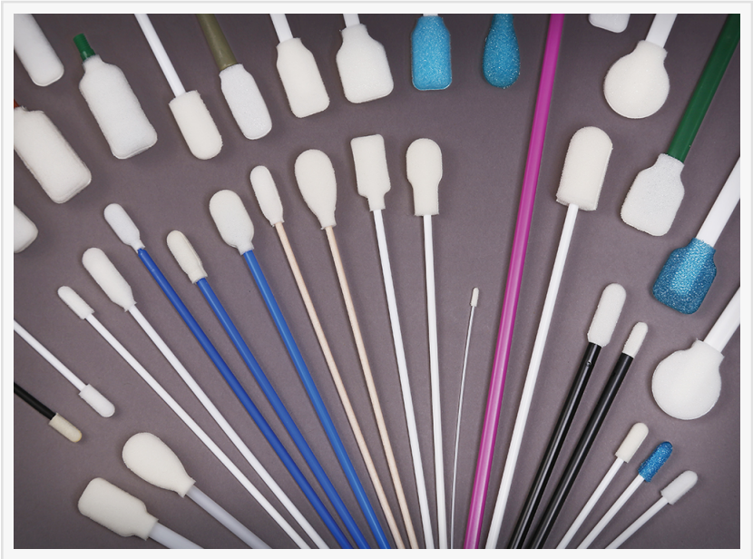
Wide-range of foam swabs

This press release can be viewed online at: http://www.einpresswire.com