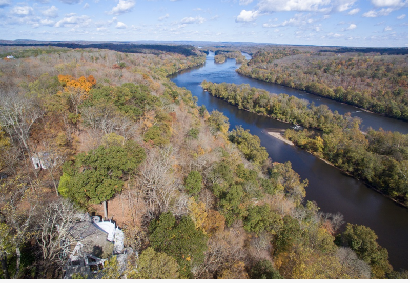
Private and Secluded Setting in Bucks County

This press release can be viewed online at: http://www.einpresswire.com